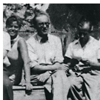
Le Corbusier, Pierre Jeanneret, Charlotte Perriand

In 1922, Le Corbusier began working in the new rue de Sèvres, Paris, atelier with his cousin Pierre Jeanneret with whom he shared research projects and design criteria in a profound and life-long professional relationship.