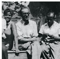
Le Corbusier, Pierre Jeanneret, Charlotte Perriand

In 1922, Le Corbusier began working in the new rue de Sèvres, Paris, atelier with his cousin Pierre Jeanneret with whom he shared research projects and design criteria in a profound and life-long professional relationship.