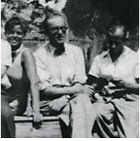
Le Corbusier, Pierre Jeanneret, Charlotte Perriand

In 1922, Le Corbusier began working in the new rue de Sèvres, Paris, atelier with his cousin Pierre Jeanneret with whom he shared research projects and design criteria in a profound and life-long professional relationship.