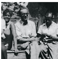
Le Corbusier, Pierre Jeanneret, Charlotte Perriand

In 1922, Le Corbusier began working in the new rue de Sèvres, Paris, atelier with his cousin Pierre Jeanneret with whom he shared research projects and design criteria in a profound and life-long professional relationship.